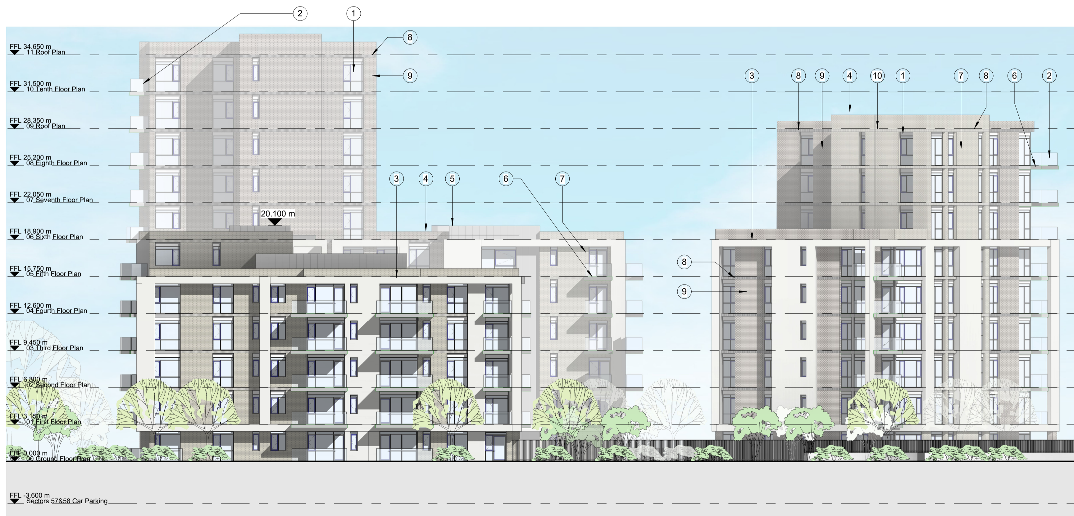
Block 8B Elevation 2