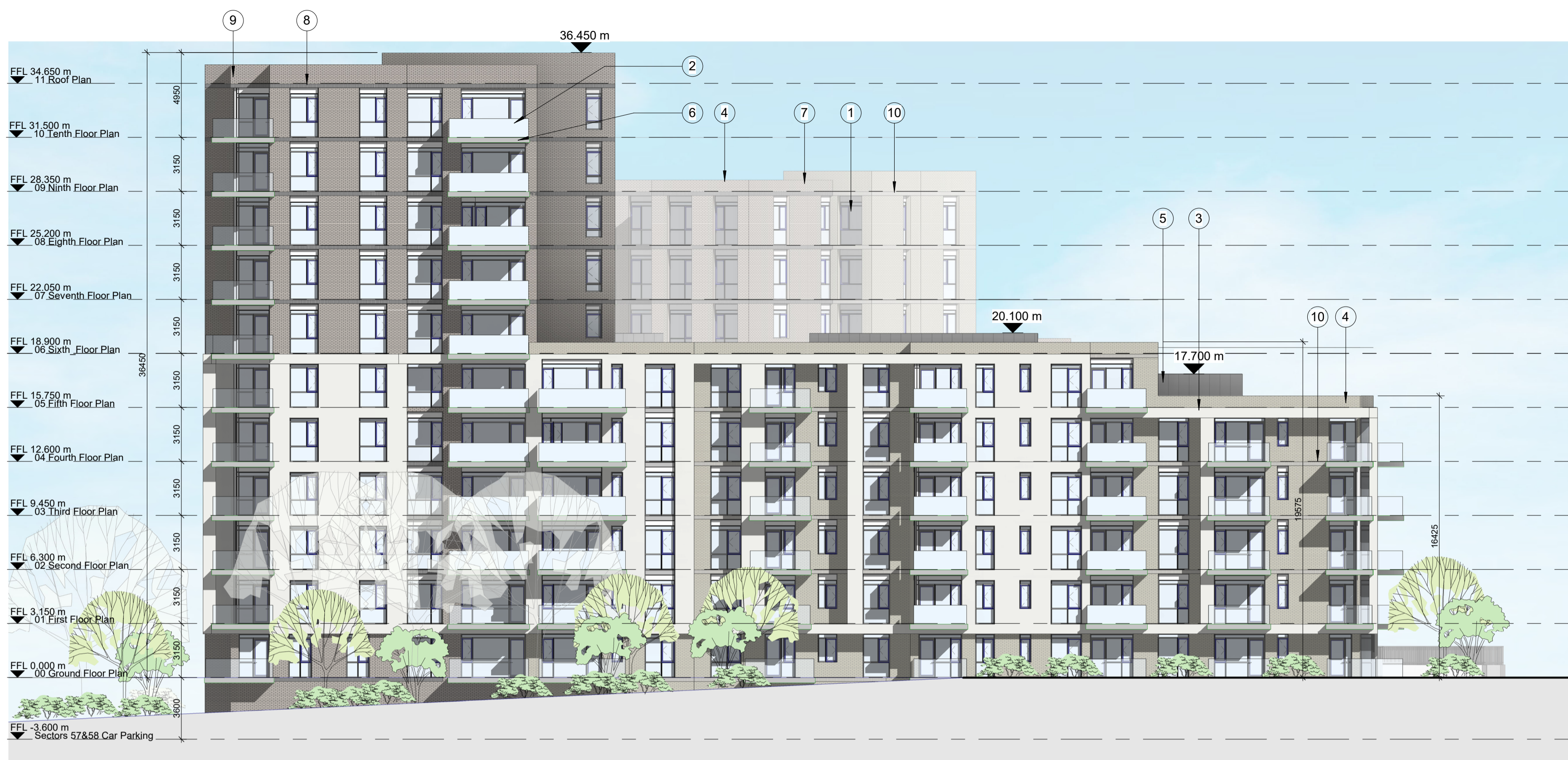
Block 8B Elevation 1